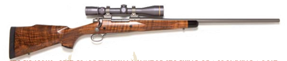
STOCKWORKS - BEST GRADE TURKISH WALNUT RE-STOCKING OF A BROWNING A-BOLT