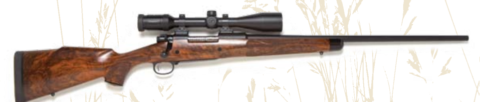
WALKABOUT RIFLE IN 270 WSM