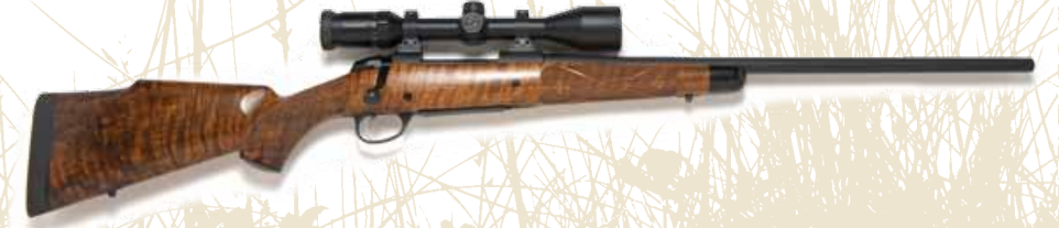
WALKABOUT RIFLE IN 270 WIN