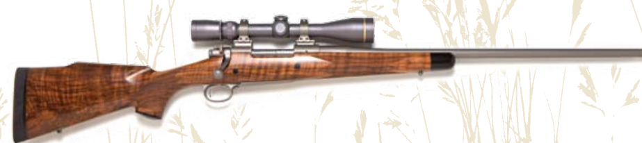
WALKABOUT RIFLE IN 300 WSM