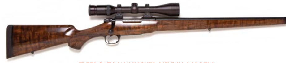
TIGERCAT MANNLICHER RIFLE IN 260 REM.