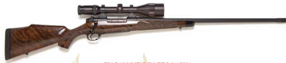
AFRICAN RIFLE IN 338 LAPUA