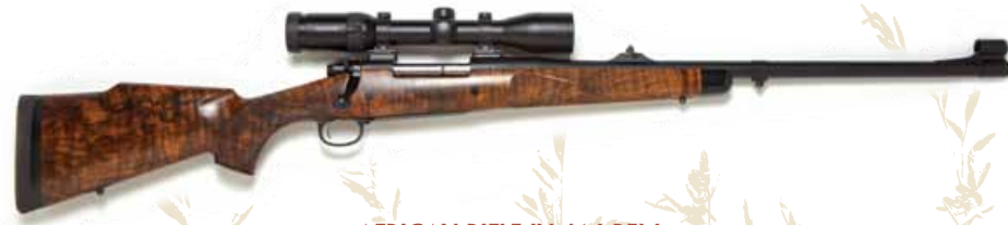
AFRICAN RIFLE IN 416 REM.