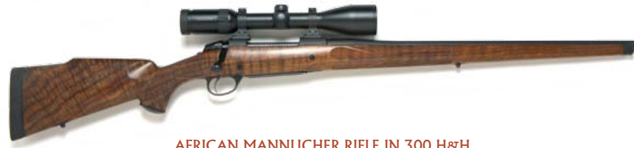
AFRICAN MANNLICHER RIFLE IN 300 H&H