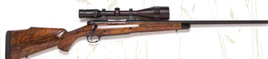
WALKABOUT RIFLE IN 6.5 X 284 NORMA