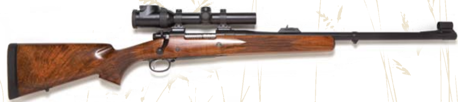
KODIAK RIFLE IN 416 KILIMANJARO