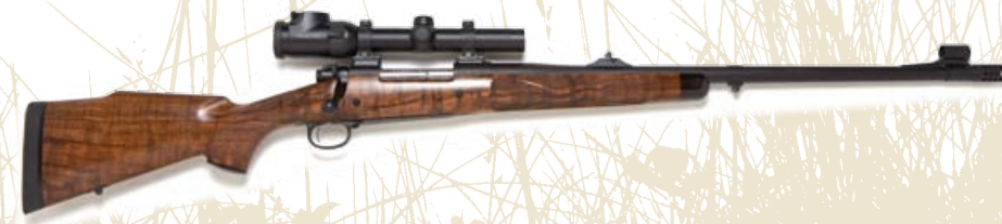
AFRICAN RIFLE IN 458 LOTT