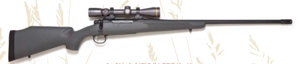
JAGUAR RIFLE IN 375 H&H