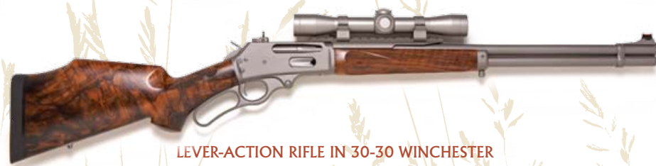
LEVER-ACTION RIFLE IN 30-30 WINCHESTER