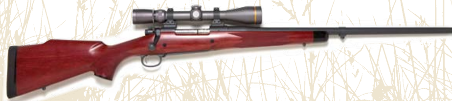
AFRICAN RIFLE IN 338 WIN.