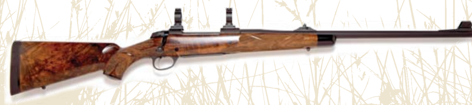
AFRICAN RIFLE IN 375 H&H