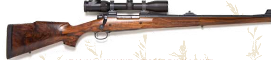
AFRICAN MANNLICHER RIFLE IN 9.3 X 62 MAUSER